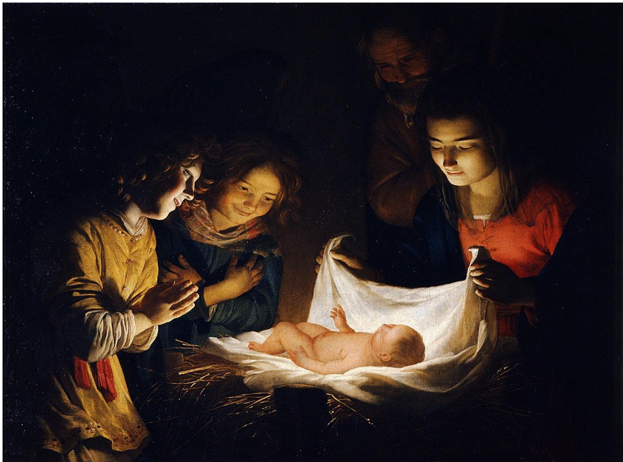
Adorazione del Bambino - Gerard van Honthorst, 1620