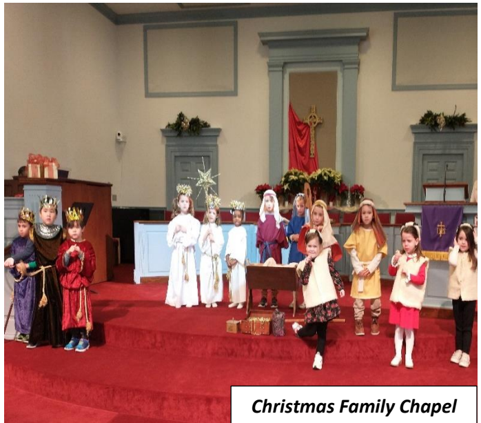
Christmas Family Chapel