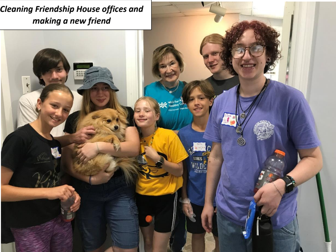
Cleaning Friendship House offices and making a new friend