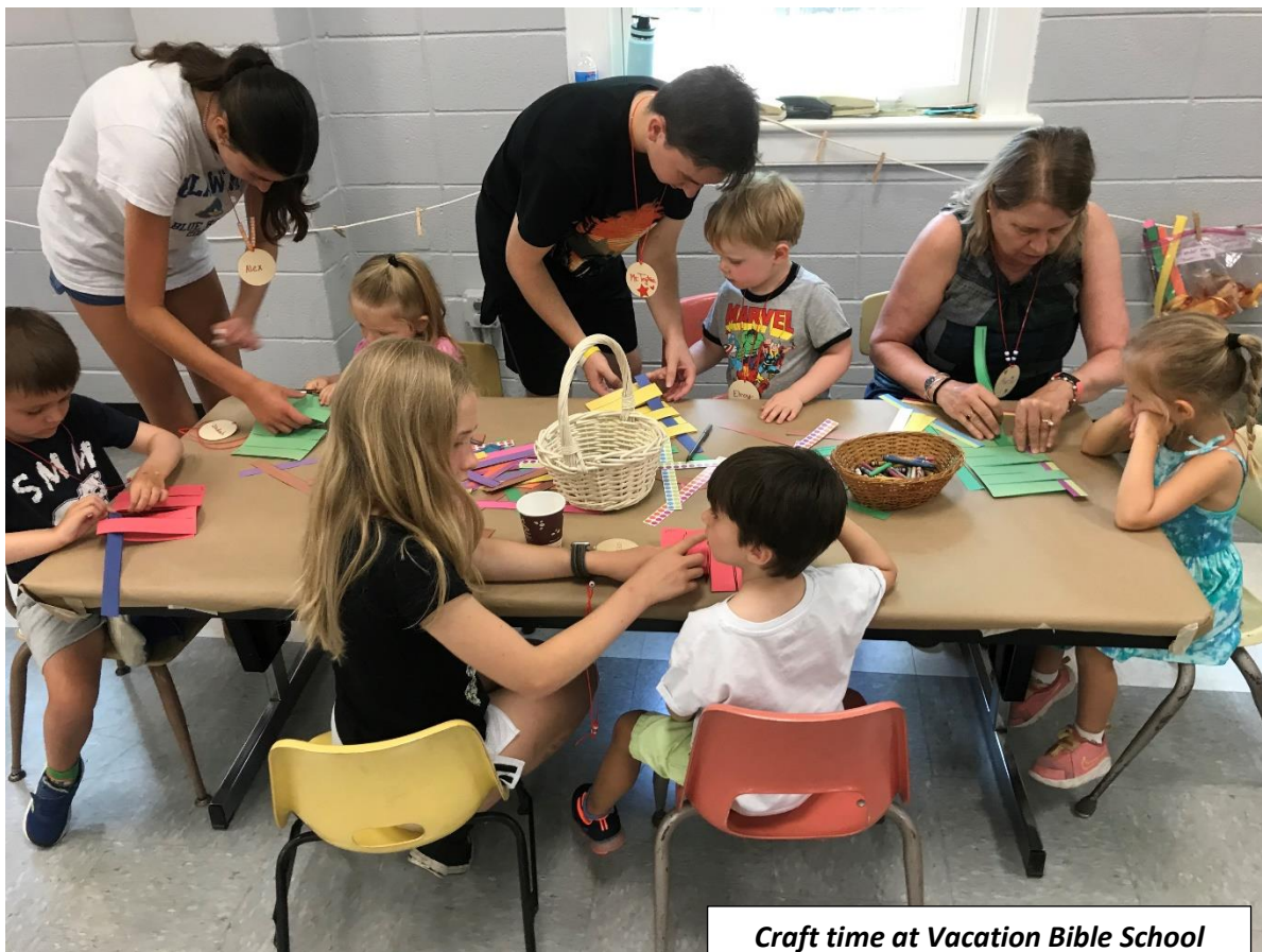
Craft time at Vacation Bible School