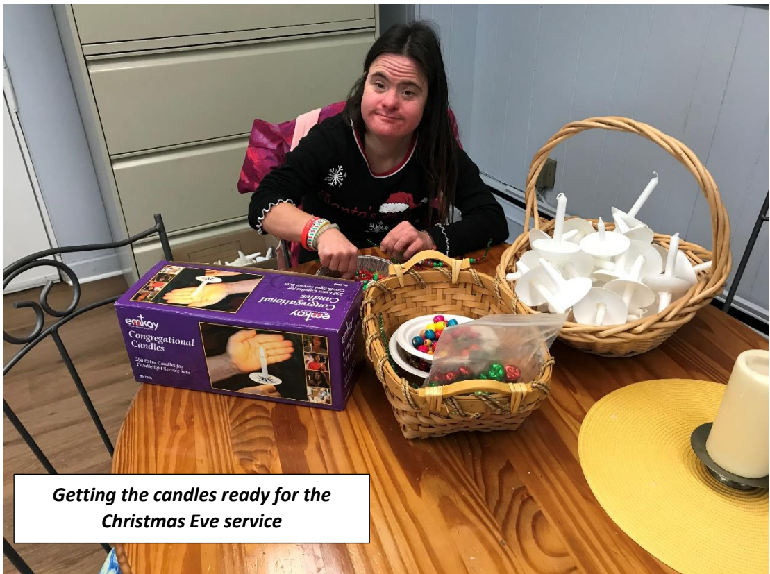
Getting the candles ready for the Christmas Eve service