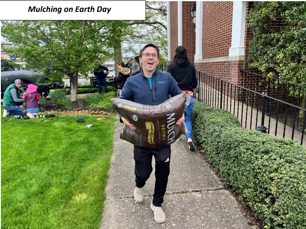
Mulching on Earth Day