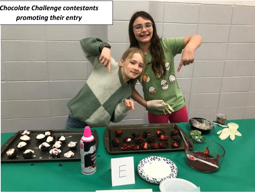
Chocolate Challenge contestants promoting their entry